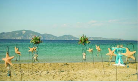
Simple decorations can be organised