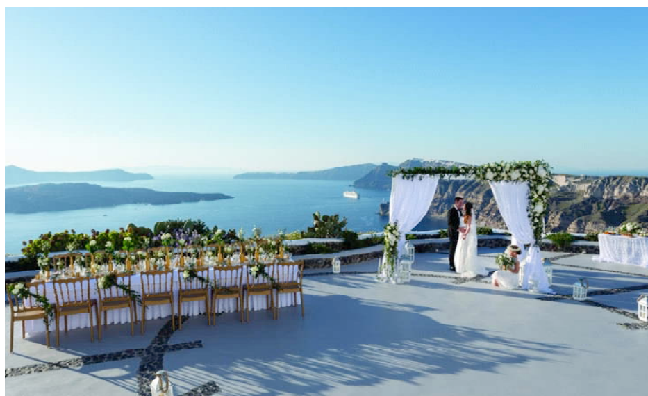
Wedding receptions can take place on the 'Upper Terrace'