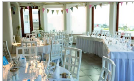
A wide choice of options for wedding receptions