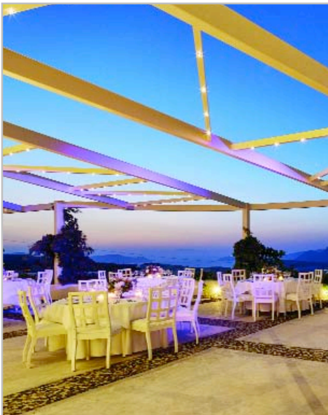
Your evening reception can take place outdoors if you prefer