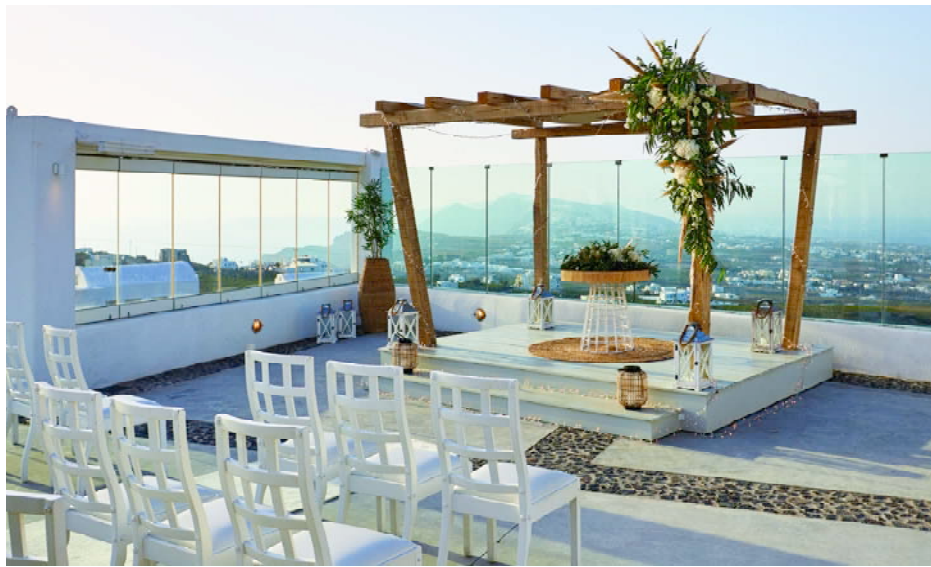
All set up for a late afternoon wedding ceremony

The popular Pyrgos Restaurant is situated just at the entrance of the village of Pyrgos and as the area commands the highest location on the island, breathtaking views of the surrounding area, including the spectacular Caldera, Fira, Imerovigli and Oia are guaranteed. Pyrgos Restaurant offers a gorgeous setting for wedding ceremonies on the Aghia Fotini terrace that sits by the picturesque on-site chapel. You may book 'just the ceremony' anytime between 11am and 2pm. If you prefer a later wedding from 4pm, you'll need to also have your reception at Pyrgos Restaurant.