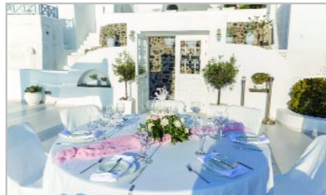
Stunning terrace set up