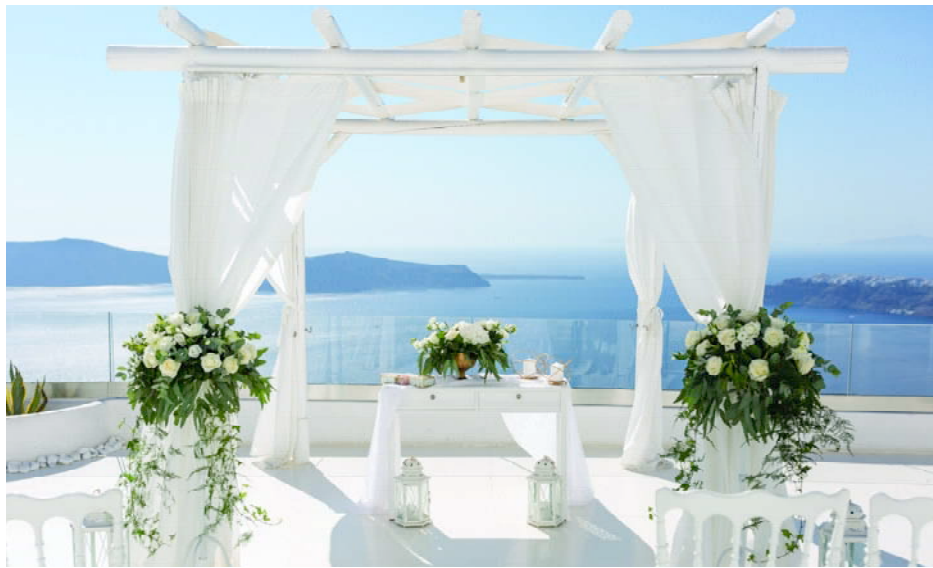
The whiter than white terrace, standing above the sea, provides a wonderful setting for wedding ceremonies

Andromeda Villas & Spa is located in Imerovigli, a village known for its breathtaking sunset over the Caldera and its traditional houses carved into the reddish cliffs. This luxury retreat, made up of 58 traditionally furnished rooms, apartments and suites is also a magical wedding venue. The outdoor terrace, set high above the deep blue sea, provides a wonderful setting for you and your future spouse to exchange your important vows in the company of family and friends.