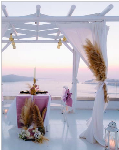
Very individual and striking decorations of the venue