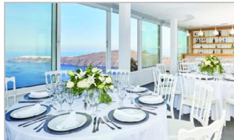
Wedding reception with a sea view