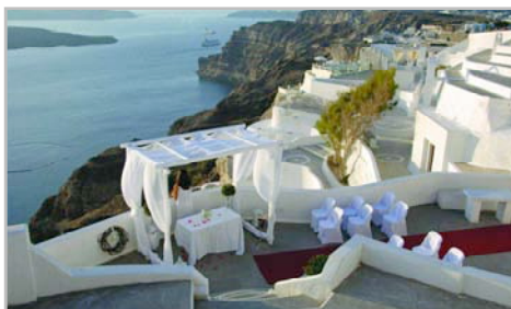
The panoramic wedding ceremony terrace