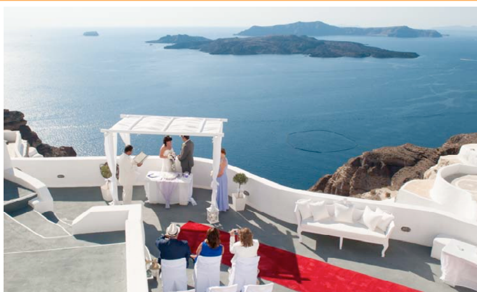
Finishing touches, such as a red carpet, can be added to the wedding package to make it as individual as you wish