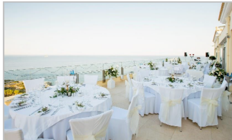
The roof terrace