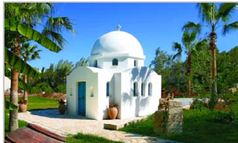
Azia Chapel, a very picturesque ceremony venue