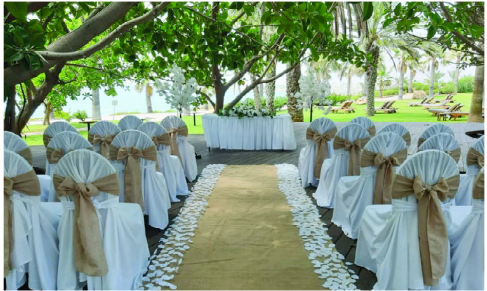
A beautiful set-up for a wedding ceremony on the Tree Deck