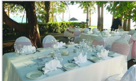
Wedding reception on the Tree Deck