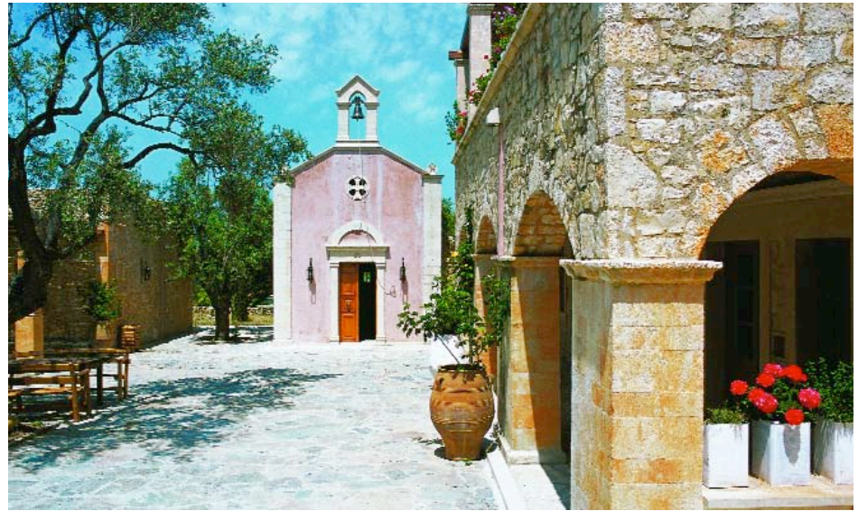
The wedding ceremony takes place in the 'village square' of the estate