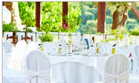
The on-site restaurant, a perfect venue for your reception